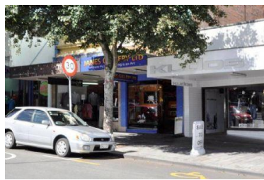
Front of the building