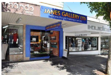
Front of the building